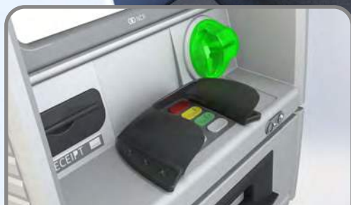
Elegant design with PIN Protecting Feature