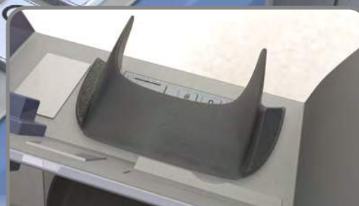
Anti-Camera design to protect PIN from hidden Camera